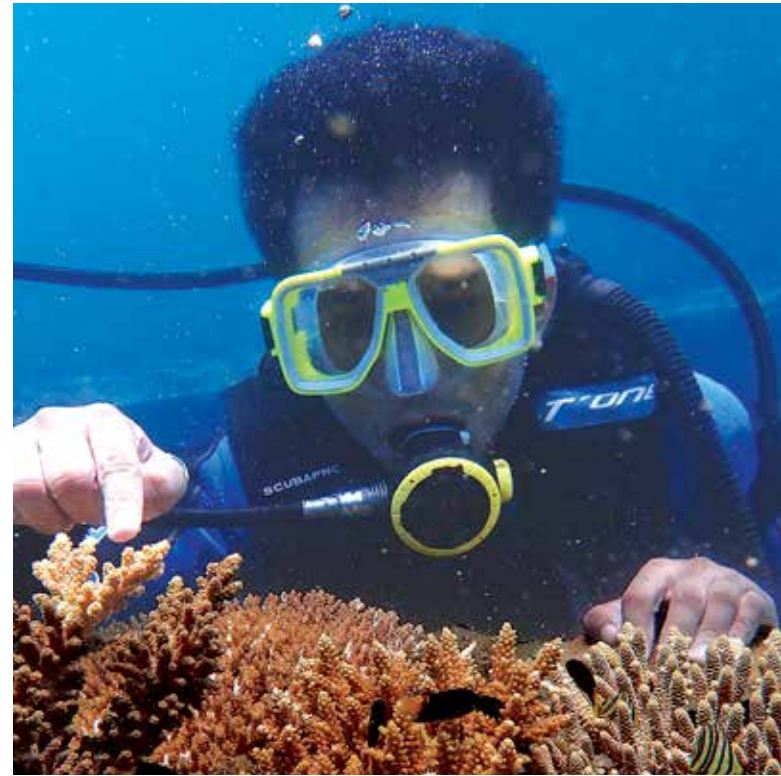
Rotary members partnered with local fishermen to build an artificial reef that helped save the fishing industry in Atimonan, Quezon Province, Philippines.