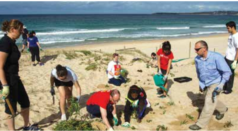
Rotaractors and other volunteers clean the beach and plant grasses to prevent erosion at Wanda Beach in Cronulla, NSW, Australia. Rotaract Preconvention Meeting.

The benefits of plastic are undeniable. The material is cheap, lightweight, and easy to make. These qualities have led to a boom in the production of plastic over the past century. Plastic packaging helps reduce food waste by extending shelf life. However, with this boom has come a major downside: plastic pollution. It is one of the biggest environmental challenges of our time. Each year, about 8 million tonnes of plastic enters the ocean from rivers, creeks, and drains, and ends up either floating on the surface or deposited on beaches or in ocean sediment. 1 As plastic is designed to be durable, waste plastic can last a very long time in the natural environment. Plastic can harm marine life: animals, such as seals, dolphins, and sea turtles become entangled in plastic fishing lines, nets, and bags. They also ingest plastic, mistaking it for food, which kills them. In addition, recent studies show that over 90% of bottled water and even 83% of tap water contain microplastic particles 2 and trace amounts are increasingly detectable in our blood, stomachs, and lungs.