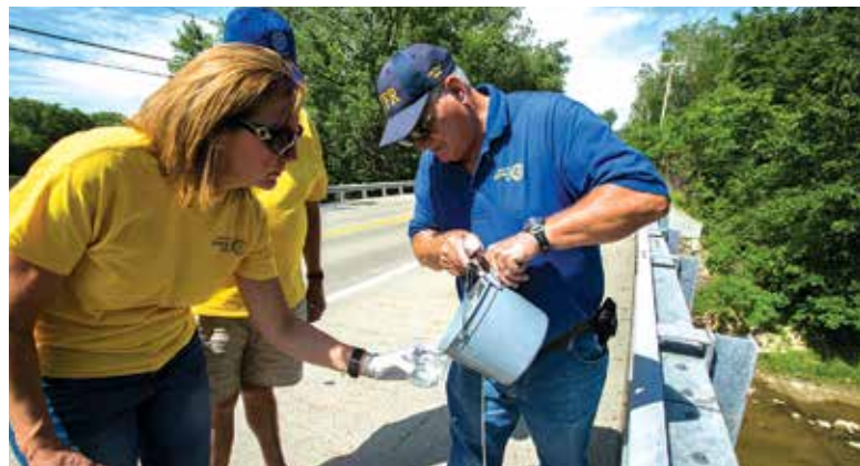
Members of the Rotary Club of Waterville, Ohio, USA, draw water samples from a stream leading into the Maumee River in Bowling Green, Ohio. Rotary clubs in Ohio and Canada near Lake Erie are addressing water contamination by testing water, sharing results, and collaborating with residents and community leaders to advocate for improved water quality.